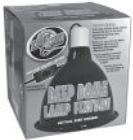
Deep Dome Lamp Fixture Item LF-17