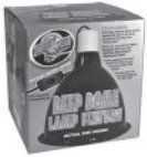
Deep Dome Lamp Fixture Item LF-17