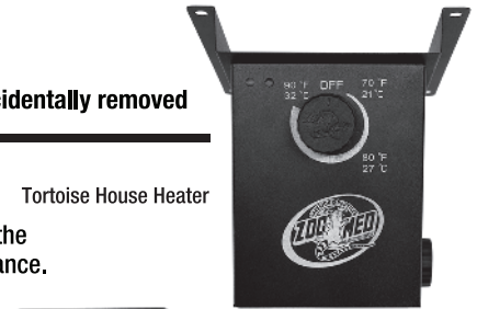
Tortoise House Heater

Zoo Med Laboratories, Inc. (Zoo Med) warrants each TORTOISE HOUSE HEATER to be free of defects in material and workmanship under normal use and service for one year from the date of purchase. The obligation under this warranty is limited to the repair or replacement, at Zoo Med's discretion, of the product or any part thereof, when the product is returned to Zoo Med, freight prepaid. No claim shall be allowed under this warranty if, in the opinion of Zoo Med, the TORTOISE HOUSE HEATER has been subject to accident or improper usage, including but not limited to: water damage, improper storage, accidental dropping, etc. This warranty is in lieu of all other warranties and representations expressed or implied. Please include your receipt, full name, address, phone number, and email address along with a note explaining failure when sending any product back to Zoo Med. Please allow 4 to 6 weeks for repair or replacement.