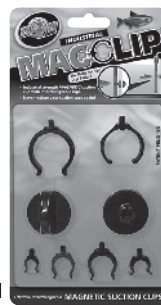
Mag Clip Item# MS-1