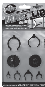
Mag Clip Item# MS-1