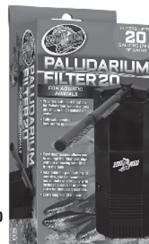
Paludarium Filter 10 Item# PF-10 Paludarium Filter 20 Item# PF-11