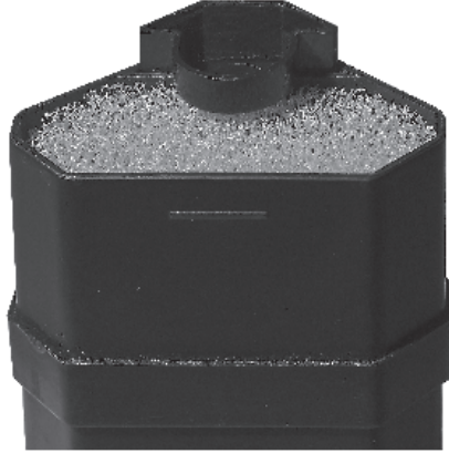
PART #6 ATTACHED