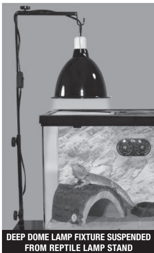
DEEP DOME LAMP FIXTURE SUSPENDED FROM REPTILE LAMP STAND